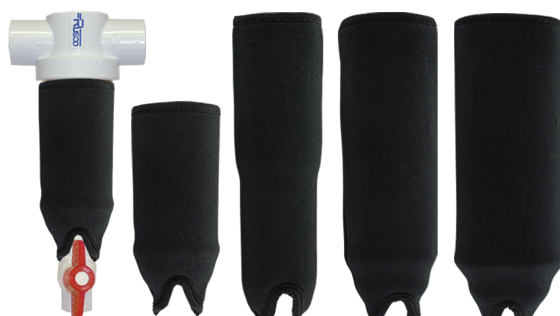
NP-SS10 NP-SS11 NP-SS15 NP-SS20